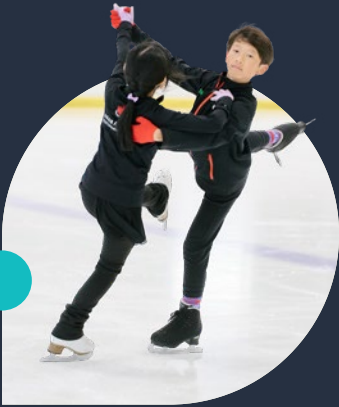
Building Critical Infrastructure