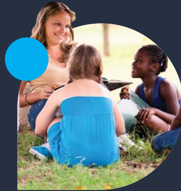
Supporting the Workforce