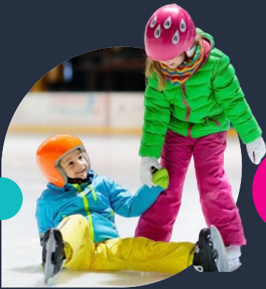
Building Critical Infrastructure